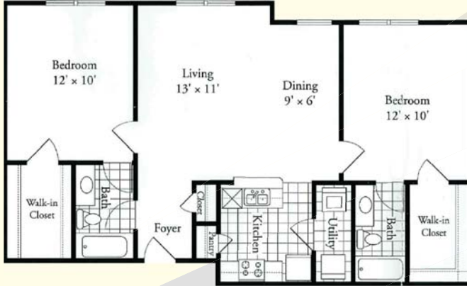
Two Bedroom / Two Bath 836 Sq. Ft.*