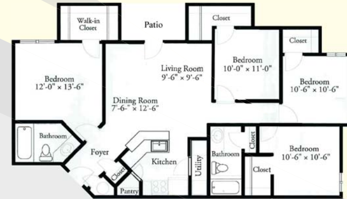
Four Bedroom / Two Bath 1,280 Sq. Ft.*

Vickery Park with superbly landscaped grounds and highly acclaimed after-school program will only enhance your experience at Vickery Park! Elegant two, three and four bedroom homes are surrounded by gorgeous scenic landscapes. Come visit Vickery Park today!